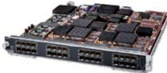
Figure 1. Cisco MDS 9000 Advanced Services Module

The Cisco MDS 9000 Family 32-Port Fibre Channel Advanced Services Module enables pooling of heterogeneous storage for increased storage utilization, simplified storage management, and reducing total cost of storage ownership. The Advanced Services Module incorporates all the capabilities of the Cisco MDS 9000 Family 32-Port Fibre Channel Switching Module and also provides scalable, in-band storage virtualization services. Combining a highly distributed processing architecture and integrated VERITAS Storage Foundation for Networks software, the Cisco Advanced Services Module delivers best-in-class virtualization performance, which can be scaled by simply adding modules anywhere in the fabric to meet the performance needs of even the largest enterprises. The Cisco Advanced Services Module is available in a 32-port configuration and accepts the same 2-Gbps Fibre Channel small form-factor pluggable (SFP) optical modules as MDS 9000 Family Fibre Channel switching modules.